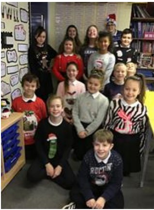
Year 6 had great fun during Christmas jumper day, they enjoyed a super Christmas dinner and took part in a Christmas quiz.